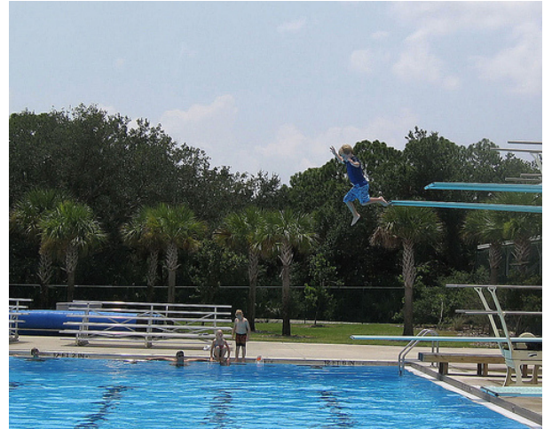
Figure 1: An example image from https://www.flickr.com/photos/floridatania/1057089366 .

Example The example image (see Figure 1) is classified as follows: